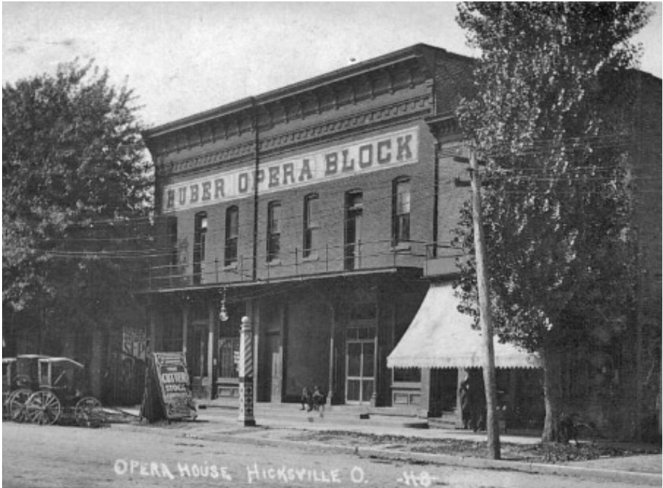
Huber Opera House when first built.