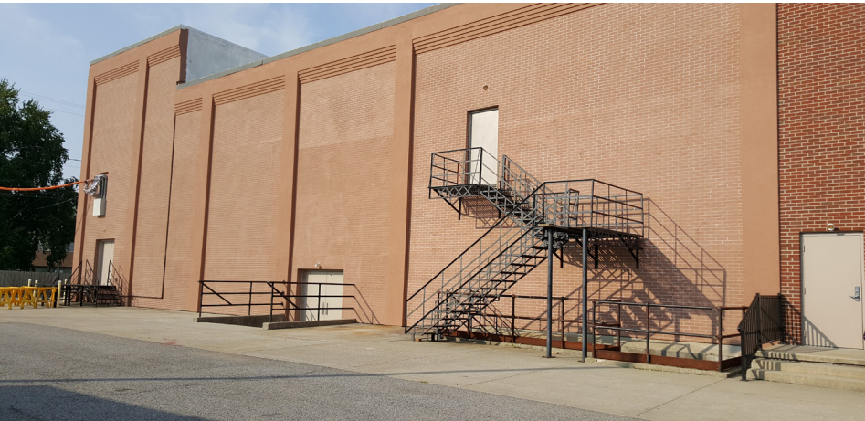
Completed brick wall at the Huber.

Thanks to generous donors, the exterior walls have been repaired and the interior walls, floor joists under the exterior walls, and the doors of the auditorium are now restored due to water leaking, damage that occurred from the deteriorated exterior walls. However, other areas of the facility needing attention include the balcony, interior walls of the stage area, stage floor/stairs, basement areas, storage areas, lighting and sound equipment.